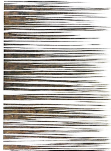
Lars Fishedick 80 Cuts And No Wound 2016 Acrylic on wood 244 cm x 122 cm